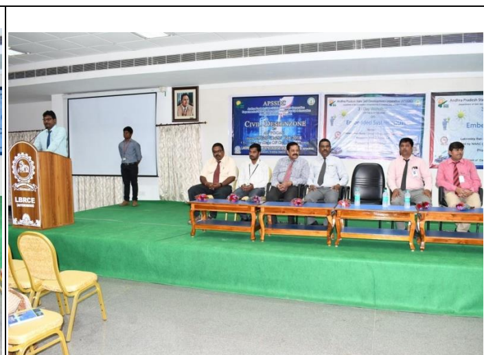
Principal addressing the students about event