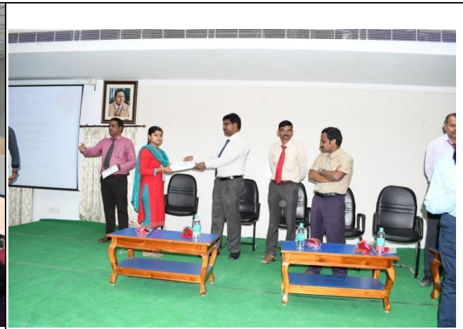
Principle presenting certificates