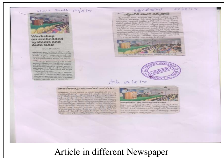
Article in different Newspaper